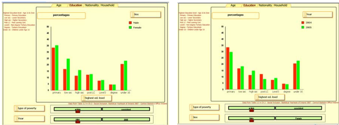
Figure 1a, 1b. Poverty rates in Ireland by education