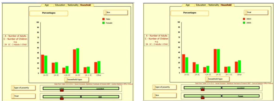
Figure 2a, 2b. Poverty rates in Ireland by composition of household